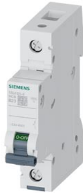
Miniature circuit breaker 230/400 V 6kA, 1-pole, B, 20 A