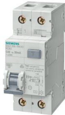
RCBO, 6 kA, 1P+N, type A, 30 mA, B char., In: 16 A, Un AC: 230 V