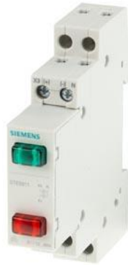
Indicator light 2 lamps 230 V red green