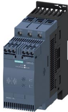
SIRIUS soft starter S2 45 A, 22 kW/400 V, 40 °C 200-480 V AC, 110-230 V AC/DC Screw terminals