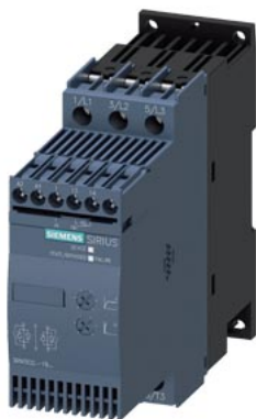
SIRIUS soft starter S0 25 A, 11 kW/400 V, 40 °C 200-480 V AC, 24 V AC/DC Screw terminals