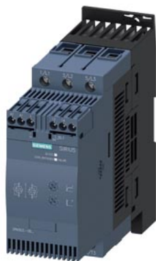
SIRIUS soft starter S2 72 A, 37 kW/400 V, 40 °C 200-480 V AC, 24 V AC/DC Screw terminals