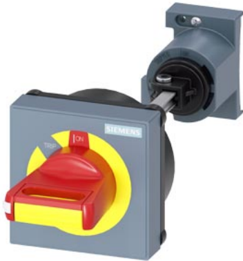
door-coupling rotary operating mechanism EMERGENCY OFF, size S00...S3 130 mm shaft