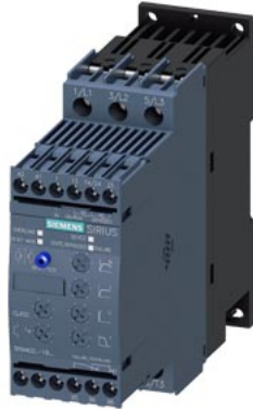
SIRIUS soft starter S0 25 A, 11 kW/400 V, 40 °C 200-480 V AC, 24 V AC/DC Screw terminals