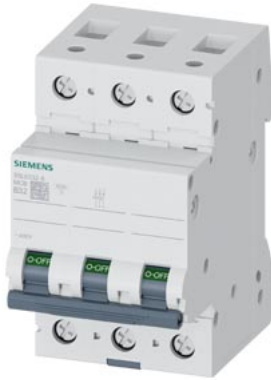
Miniature circuit breaker 400 V 6kA, 3-pole, B, 32 A