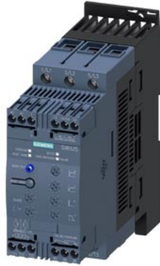
SIRIUS soft starter S2 45 A, 22 kW/400 V, 40 °C 200-480 V AC, 24 V AC/DC Screw terminals Thermistor motor protection