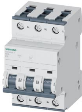
Miniature circuit breaker 400 V 6kA, 3-pole, C, 6 A, D=70 mm