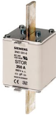
SITOR fuse link, with blade contacts, NH2, In: 350 A, gS, Un AC: 690 V, Un DC: 250 V, front indicator