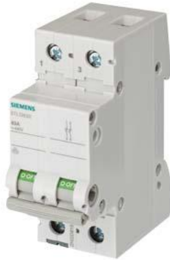
switch disconnecter, on-off switch 40 A 2-pole