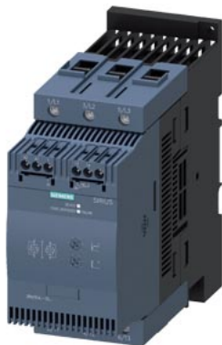
SIRIUS soft starter S3 106 A, 55 kW/400 V, 40 °C 200-480 V AC, 110-230 V AC/DC Screw terminals