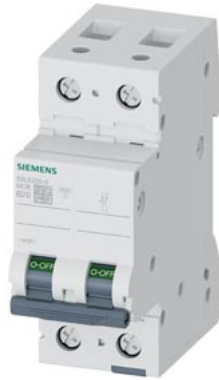
Miniature circuit breaker 400 V 6kA, 2-pole, B, 20 A