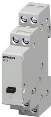
Remote control switch with 2 NO contacts, Contact for 230 V AC, 400V 16A Control 24 V AC