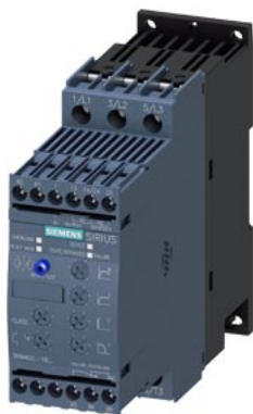
SIRIUS soft starter S0 12.5 A, 5.5 kW/400 V, 40 °C 200-480 V AC, 110-230 V AC/DC Screw terminals