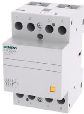
INSTA contactor with 4 NO contacts Contact for 230 V AC, 400V 40A Control 230 V AC