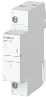
SENTRON, cylindrical fuse holder, 8x32 mm, 1-pole, In: 20 A, Un AC: 400 V, LED signal detector