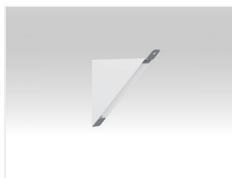
ACC271 45° installation wall bracket white color.