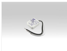
ACC241 Universal dimmer with 230Vac phase cut output.